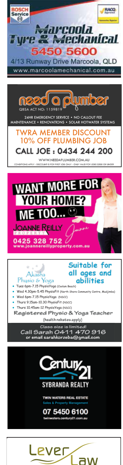
YOUR LOCAL SOLICITOR Family Law, Civil Litigation & Personal Injuries Conveyancing, Estate Planning, Commercial & Business Law issues.