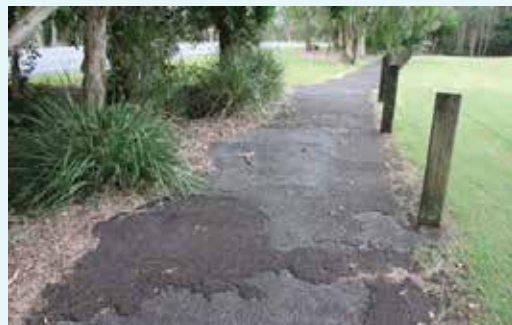
Before and After photos below tell the story.

After nearly 2 years of planning and negotiation, the Ocean Drive footpath replacement that encroached onto Twin Waters Golf Club land due to a surveying mistake in the 1990s is almost done.