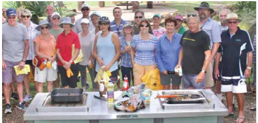
TWRA members combining a friendly Bar-B-Que with their annual Twin Waters clean-up.

Joining is easy. Just go to the website at www.twra.net and click on the link headed TWRA Membership.