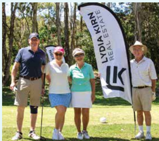
Golfers and the ever-present kangaroos massed for the TWRA Golf Day on a brilliant Sunday, 25 September