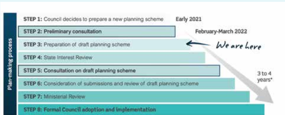
Diagram of the overall timeframe for shaping the new Town Plan.

Council plans to share its proposed draft for public consultation next year.