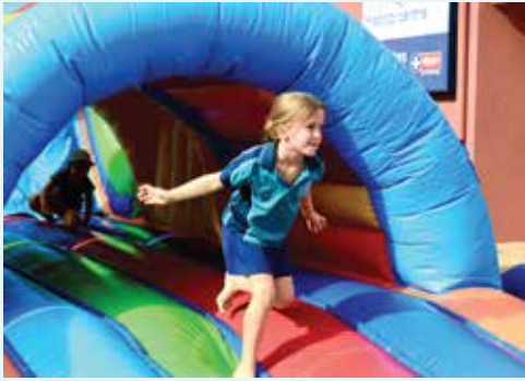
Burning off the energy of youth at the jumping castle. A big draw for the day, as well as the absolutely necessary – face painting! See Right.

It was hard to count, but estimates go as high as about 2,000 for the happy, shuffling 'Twin Waters-ites' who made their way through the Twin Waters shopping complex for Party in the 'P' – Sunday 6 November.