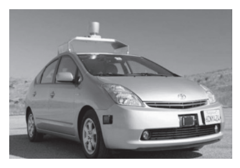
Will Google's Smart Car be the answer to cutting down our annual road death toll?

In the car's testing, there was only one accident, caused when one of the vehicles was rear-ended whilst stopping at a redlight. As to the true function the car will serve, Google argue that it will reduce the number of traffic related injuries and deaths, while using energy and roads more efficiently.