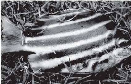
Stripey ( Microcanthus strigatus )