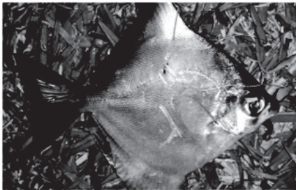
Diamondfish ( Monodactylus argenteus )

Stripey ( Microcanthus strigatus ), Narrow-lined Pufferfish ( Arothron manilensis ), Reef-flat cardinal fish ( Apogon taeniophorus ), Diamondfish ( Monodactylus argenteus ), Rabbitfish aka 'Happy Moment' ( Siganus nebulosus , venomous dorsal spines), Moses perch ( Lutjanus russellii ) Southern yellow-fin bream ( Acanthopagrus australis ), Senator Wrasse ( Pictilabrus laticlavus , funnily enough caught on Election Day!), Tarwine ( Rhabdosargus sarba )