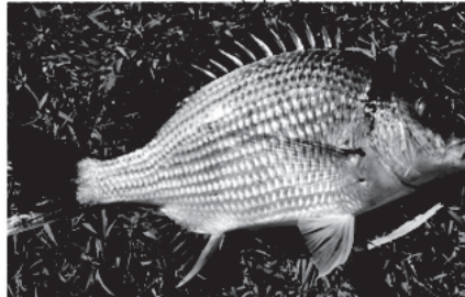
Southern yellow-fin bream ( Acanthopagrus australis )

To look at all the photos Travis has taken please visit the TWRA website and click on the Flora-fauna link http://www.twra.net/flora-fauna/