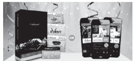
The 2016 | 2017 Entertainment™ Memberships are now available!

Available as a traditional Entertainment Book or Digital Membership on your smartphone, your Membership gives you over $20,000 worth of valuable offers valid through to 1 June 2017.