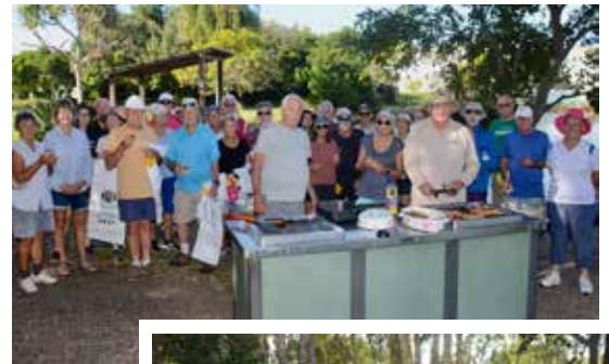
The happy crowd at the Clean-UP BBQ

Now, Twin Waters is pretty good, but it's surprising what can be found. Fast food wrappers and drink containers make up most of the rubbish that we find on the sides of roads and in our parks and gardens – even the roundabouts have rubbish. And we had a few volunteers on the water in kayaks gathering floating rubbish and rubbish caught on the banks.