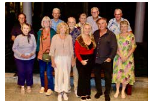
2023's Happy Winners!

Last year's competition was fantastic; we hope to have even more entries this year! Get those green fingers working!