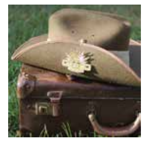
Anzac Day Service Times

Dawn Service 5:30 am. Community Service 11am Anzac Day Entertainment