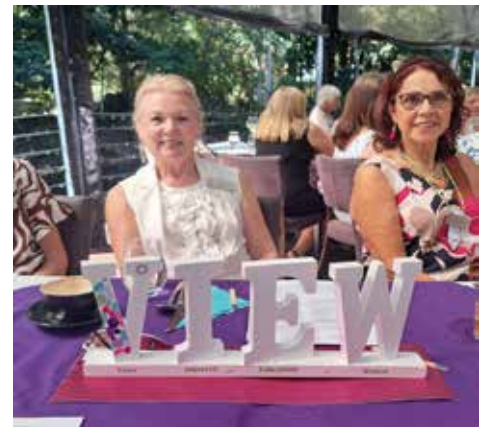
VIEW Club members at lunch. New members welcome.