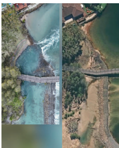
Picture above shows the river incursion. Picture on the right, the original dry bed when the weir was first built.

Following an appeal by the developers, the Planning and Environment Court's Judge Williamson upheld Council's decision because of the scale of the proposed development and the adverse impact its elevated pad to address flood plain issues would have on urban visual impact. He also noted the proposed 24 hours/7 day operation was inconsistent with the current rural setting.