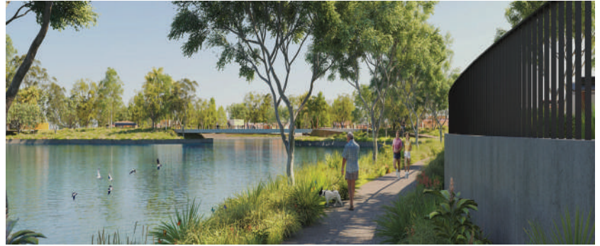
Artist impression of future Twin Waters West lake area.