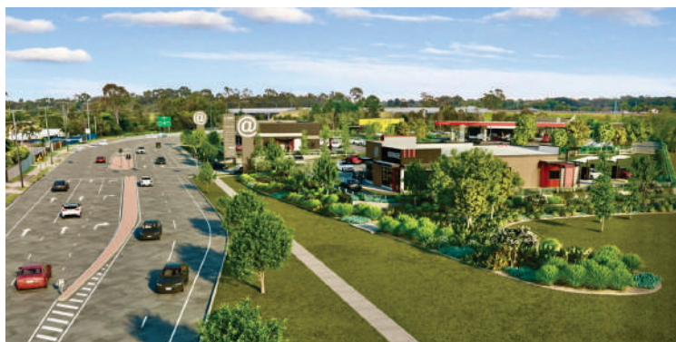
Artist impression of development.