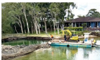
Barge Placing Rocks