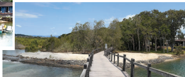
The Final Result