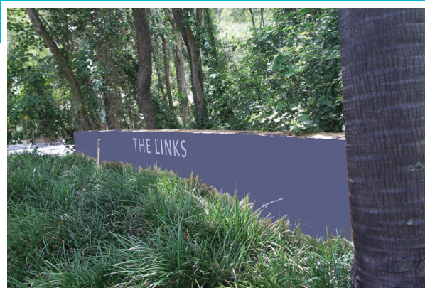
The photography app, Photoshop has been used for a mock-up of the new wall colour (Heavy Metal British Paints EDT 417)