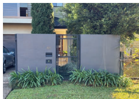
The colour is also popular for garden walls in Qld suburbs.