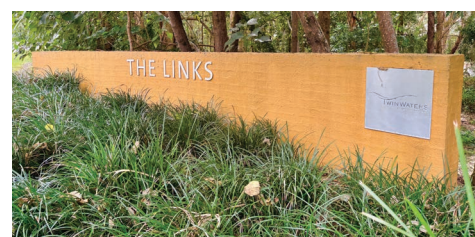
Current colour painted in 2015.