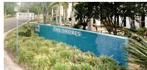
Original aqua/teal painted in 1999.

Council Traffic Engineers also explored visibility issues concerning Stillwater and Lakeview Drive but will use speed cushions to slow traffic instead.