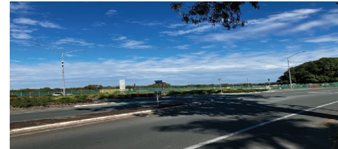
Work has begun Above: Before Left: Now